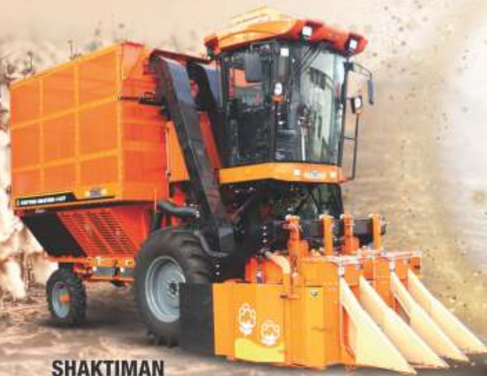
SHAKTIMAN COTTON MASTER - 1437